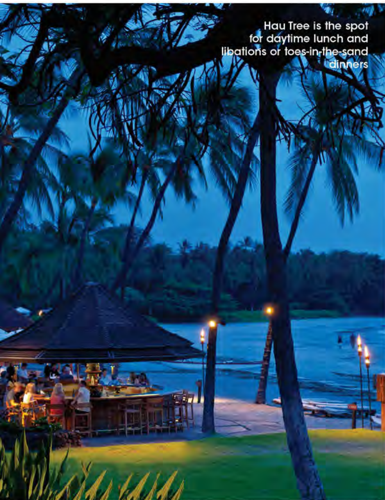
Hau Tree is the spot for daytime lunch and libations or toes-in-the-sand dinners