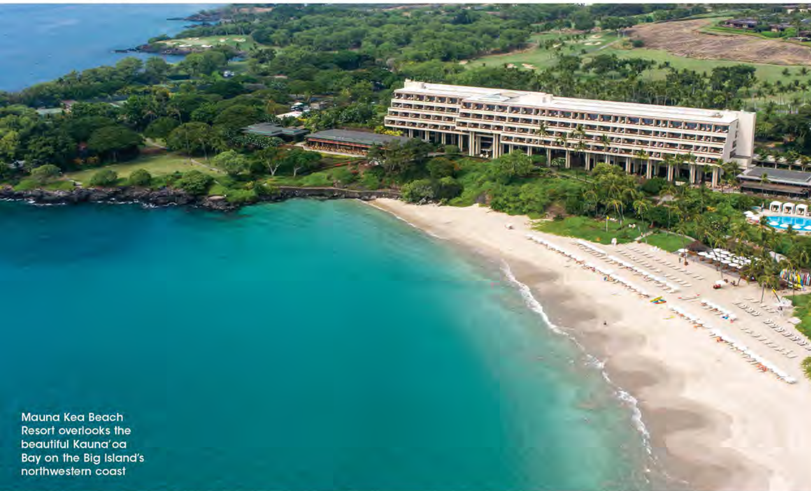
Mauna Kea Beach Resort overlooks the beautiful Kauna'oa Bay on the Big Island's northwestern coast

Mauna Kea Beach Resort sets the stage for purely magical Big Island memories BY DEANNA MURPHY