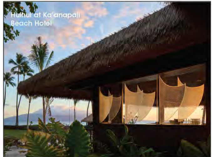
Huihui at Ka'anapali Beach Hotel