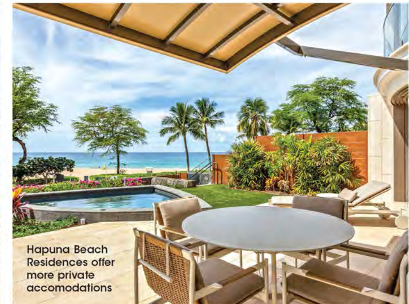
Hapuna Beach Residences offer more private accommodations

sourced art collection and a stunning display of authentic Hawaiian quilts and textiles. But possibly the most important history is more personal; that of the innumerable people who've been coming to Mauna Kea, year after year, for generations. It's a thread that's repeated in nearly every encounter with guests at the resort, and the result is a true sense of family among guests and staff, relationships forged over decades, and also of home, the welcoming familiarity and comfort that can only come from a long-nurtured relationship with one place.